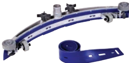
Aluminum suction system